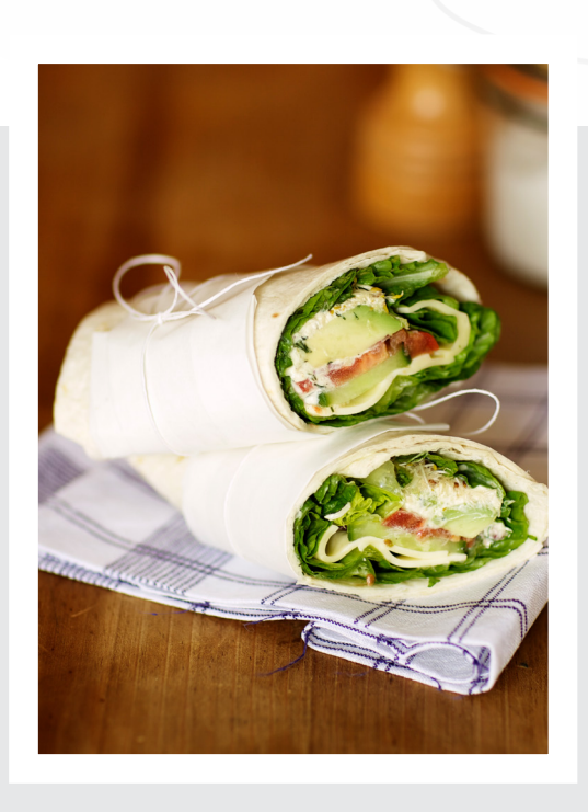
Yield: 4 servings